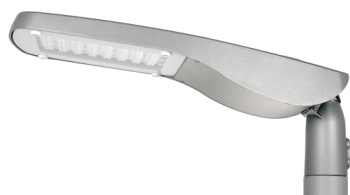
Jom L 80W